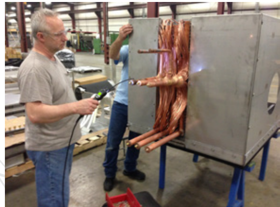
Hydrogen leak detection